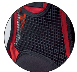
Breathable mesh panel