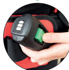
Integrated hand control