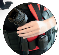
Waistbelt tool storage