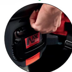
Easy battery change