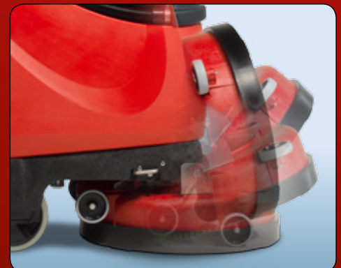
Tilting deck for easy brush change and storage