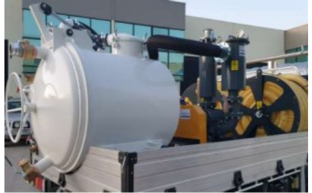
Customised Design Solutions