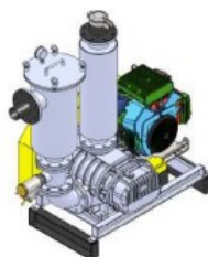
Vacuum System Positive Displacement Tri Lobe Blower operating at up to 15Hg