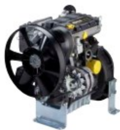
Power pack Petrol or Diesel Engine