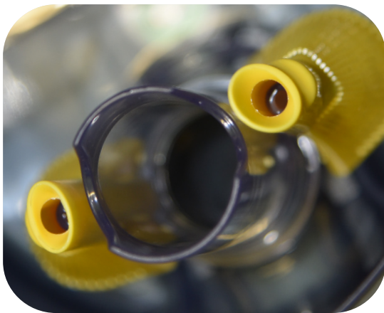
Patented RAIN SYSTEM water filter with Venturi technology

This ergonomically shaped handle is made of stainless steel and is, therefore, particularly robust.