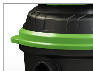
SIDE PROTECTION AGAINST DOORS AND WALLS