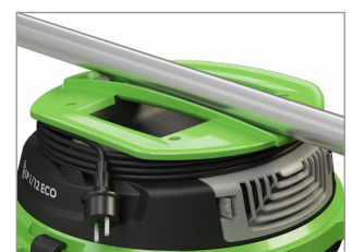
ERGONOMIC HANDLE WITH INTEGRATED CABLE WRAP