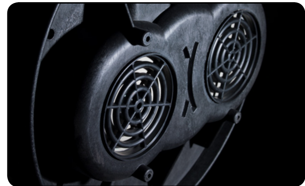
Duplex twin motor power option