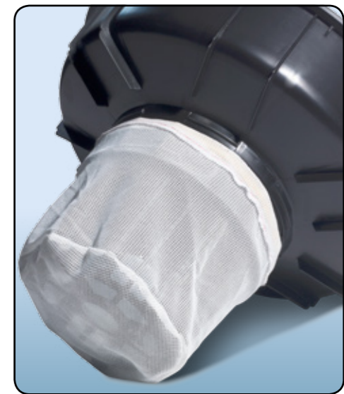
Safety net filter and float assembly