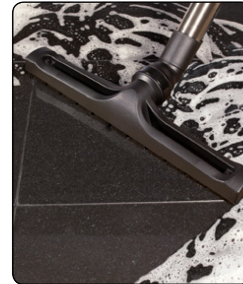
400mm wet pick up nozzle