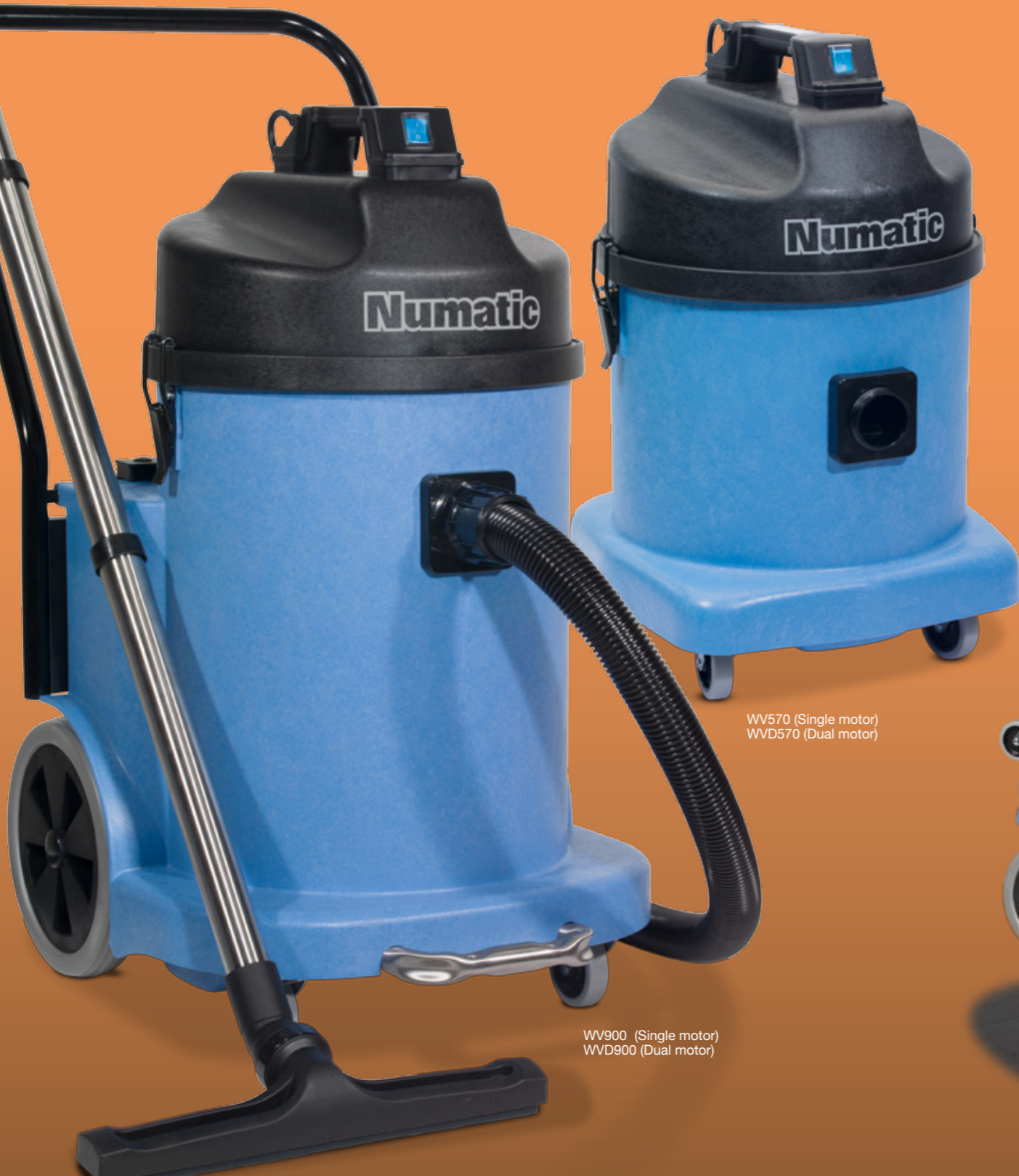
WV570 (Single motor) WVD570 (Dual motor)

EcoWets have now been raised to our full 38mm (1½") standard, providing performance enhancements allowing single motor models to perform to improved standards. Both models use complete Structofoam construction, an exceptionally tough compound that doesn't dent, scratch or deteriorate and yet it is lightweight and resists all standard cleaning chemicals.