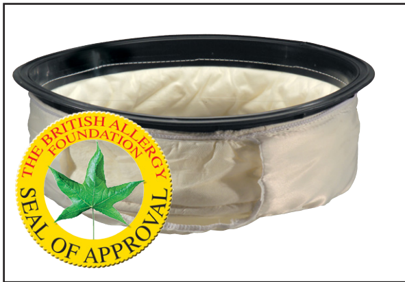
Optional HEPA Filter Upgrade