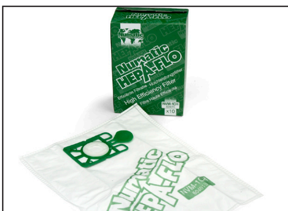
High Efficiency Hepa-flo Bags