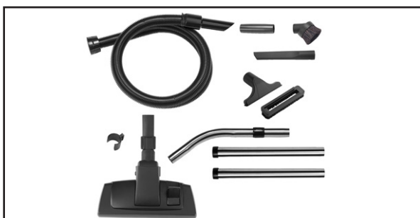
Comprehensive toolset with Stainless Steel Wands