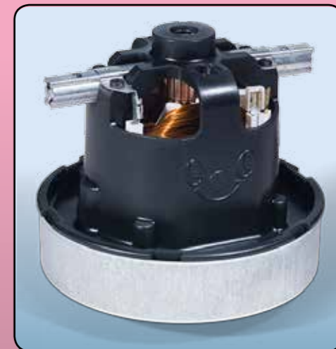
Numatic high efficiency longlife motor