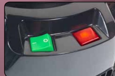
On / Off power indicator