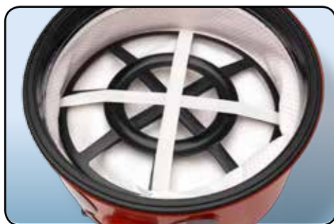
TriTex and HepaFlo high efficiency filtration system