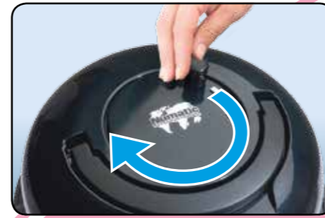
10m cable rewind and storage system