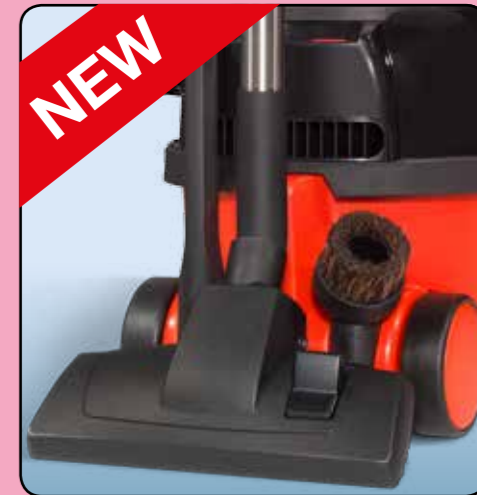
On-board tool storage