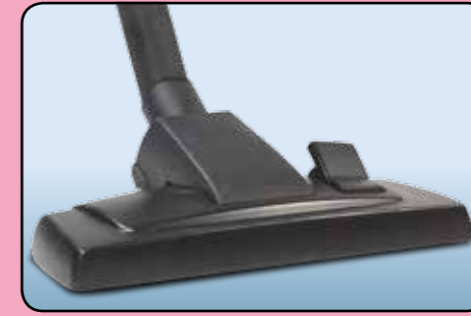
ProFlo high efficiency combi floor tool