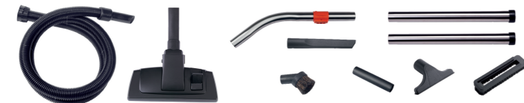
Comprehensive accessory kit

South Pacific Vacuums +64 9 520 20 30 info@spv.nz