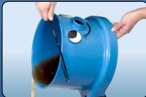
Standard easy emptying handle system