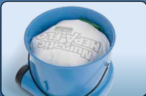
High efficiency HepaFlo bags