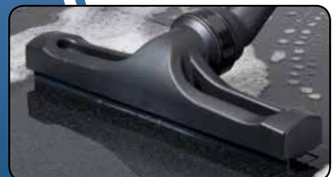
Wet pick-up nozzle