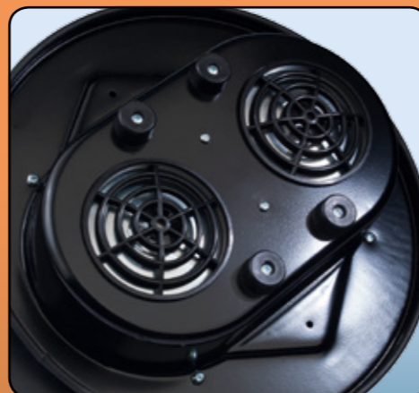
Duplex twin motor option