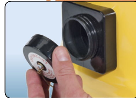
Transit safety cap top and bottom

All machines are supplied with comprehensive accessory kits including initial HepaFlo dust bags of the correct size.