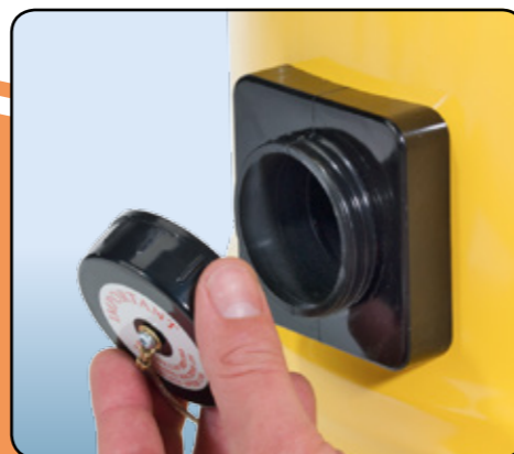
Transit safety cap top and bottom