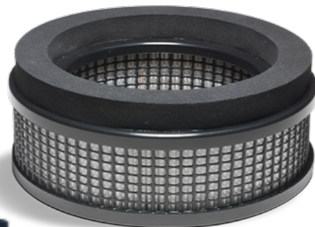
H Class Micro filter

In the selection of any dust control machine it is vitally important that the size, power and capacity are given serious consideration from the outset as the right choice will play an important, and ongoing part in terms of user satisfaction.