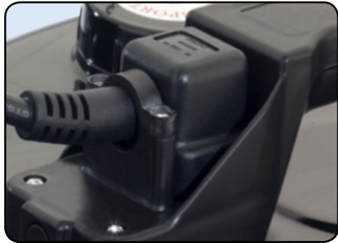
NuCable allows easy cable replacement

The collection of hazardous and possibly carcinogenic substances is a very serious requirement demanding a high standard of operation together with features that allows for an effective decontamination procedure after use. Models are available in a range of sizes from 9-litre to 40-litre all working to the same high H13 filtration standard.