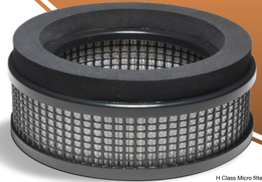
H Class Micro filter cartridge