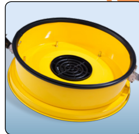
HEPA enclosed filtration module