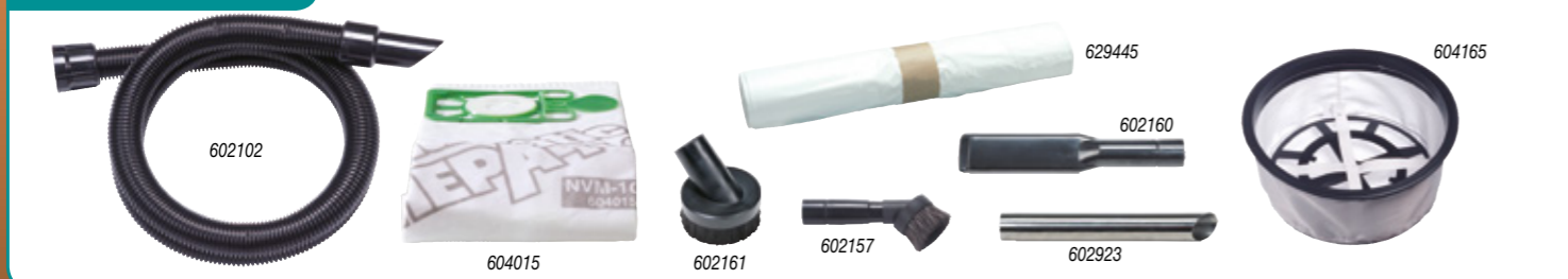
HZ200 / 250